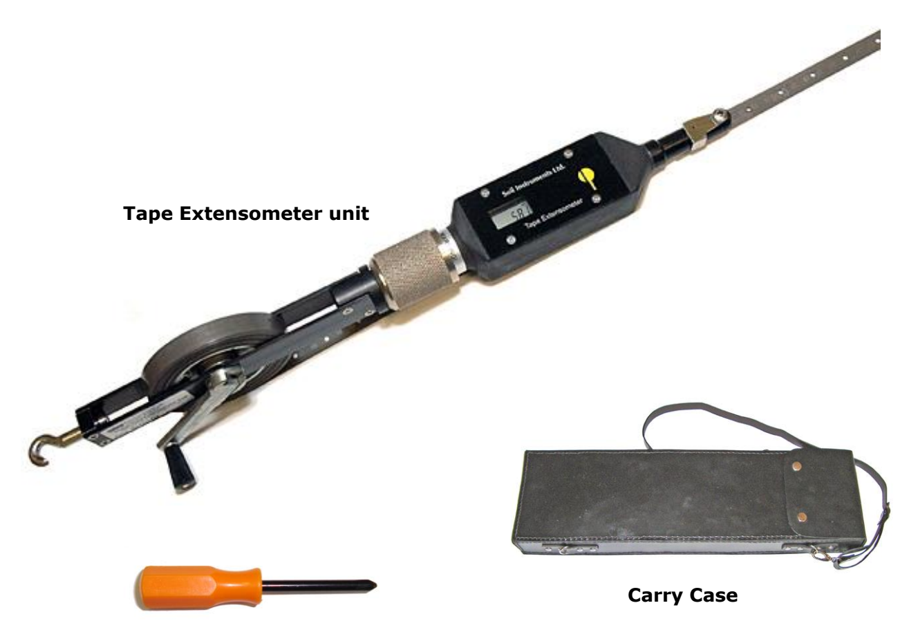
Battery change screw driver